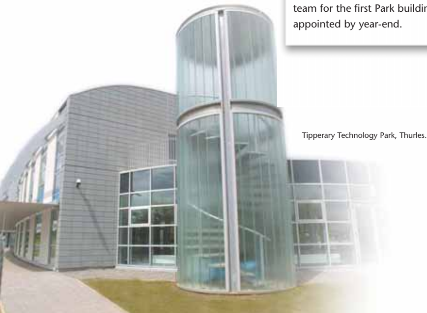
Tipperary Technology Park, Thurles.